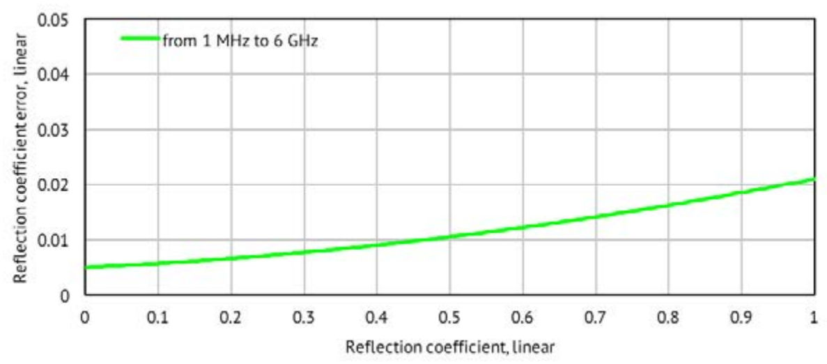
Specifications are based on isolating DUT ( S_{21} = S_{12} = 0 )